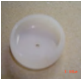
Optional Nylon Cap for Non-Carpeted Floors