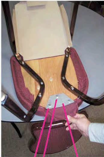
Back plate bolts 5/16" x 18 x 1" Hex