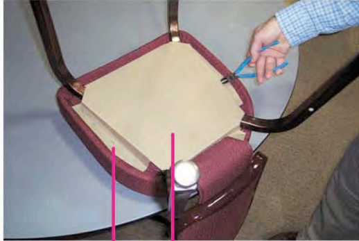
Hardboard bottom plate